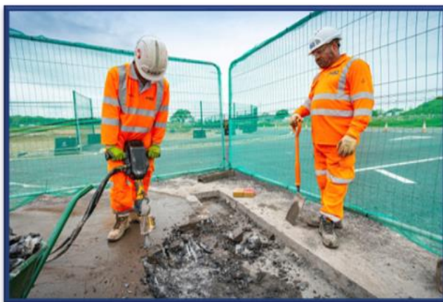
Completing works safely with traffic management.

We will need to introduce traffic management to deliver our programme of works. This could include temporary traffic lights, lane closures and full closures. We will communicate any traffic management in advance of works commencing.