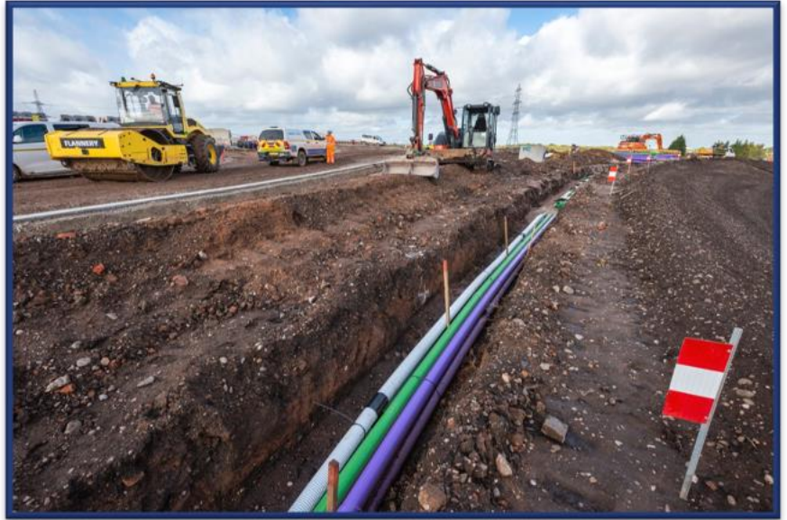
Utilities diversion are a key part of the construction process

Once we have located the utilities, we will protect these or introduce diversions to enable construction in each area.