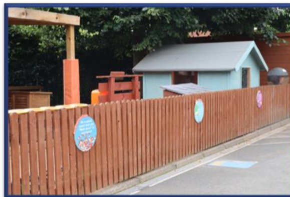
Refreshing the outdoor area at Manor Primary

We delivered STEM (Science Technology, Engineering and Mathematics) sessions to pupils in two classes that included a careers presentation and a bridge building competition. Opportunities to teach budding generations of young people about STEM are designed to inspire the engineers and rail professionals of the future. They are an incredibly important tool through which we can empower local young people.