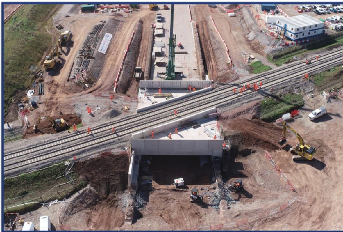
The 'marathon' bridge structure that was constructed near Lichfield.

We have completed a huge construction operation to build and move a 2,600 tonne bridge under the South Staffordshire railway line near Lichfield.