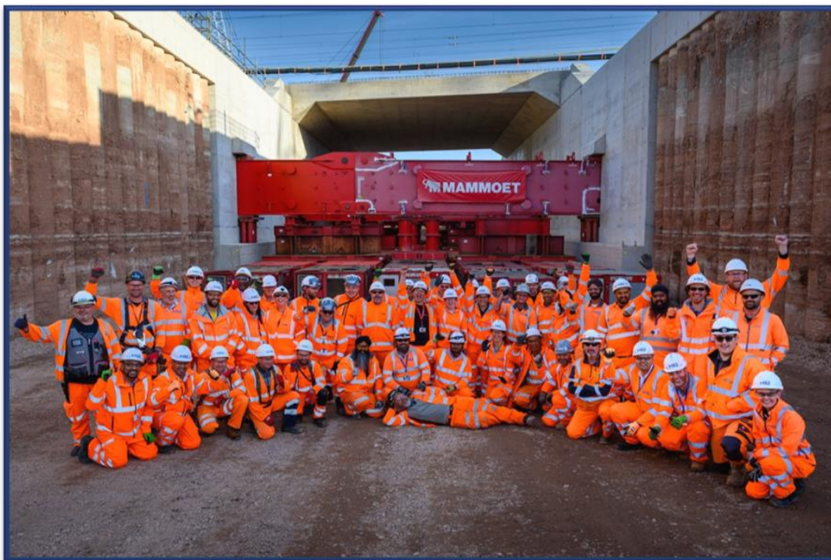
The HS2 team celebrating the incredible achievement

The HS2 team has successfully completed the UK's heaviest bridge drive to install an intersection bridge structure beneath the West Coast Main Line (WCML) at Fulfen Wood near Lichfield. The structure comes in at a huge 6,200 tonnes, 56 metres long and 19 metres wide.