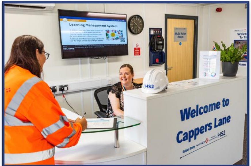
We will continue using Cappers Lane compound as a base for our teams

We will continue to use the Cappers Lane Main Compound as a base for our teams and utilise satellite compounds located near our works. We will assess and utilise satellite compounds located near to the construction works that will continue. All the other compounds in the local area will either be temporarily closed and secured or relocated.