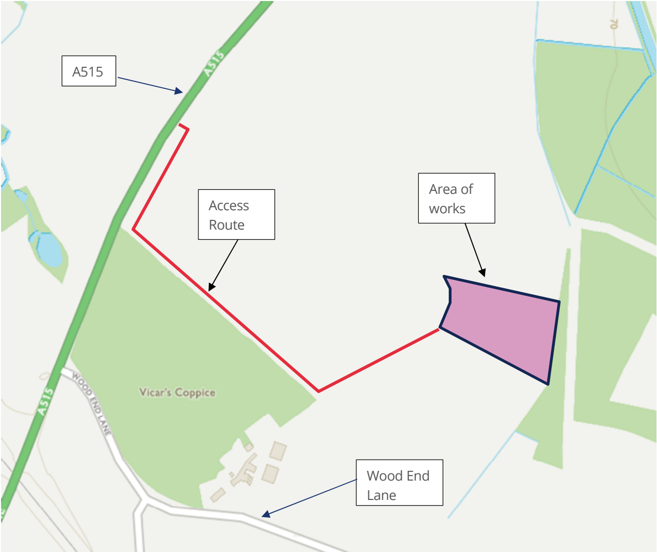
Contains Ordnance Survey ©Crown copyright and database right 2017